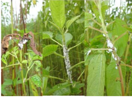
Figure 6. Mealy bug infested jute plants at Chandina Regional Station, Cumilla, BJRI.