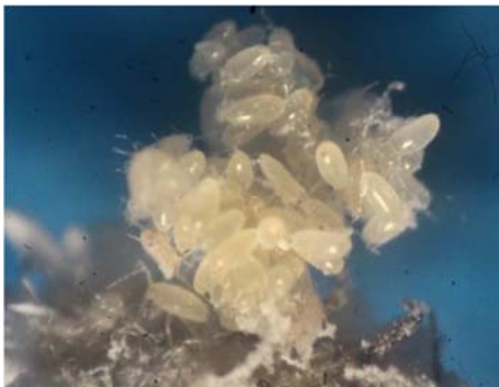
Figure 9. Egg masses of mealy bug (3.5 X).

The egg is oval in shape and measures on an average 0.315mm in length and 0.135mm in breadth (Table 2). The colour of egg is orange, smooth and translucent. The eggs are deposited in a compact, cottony and waxy sack (Figure 9).