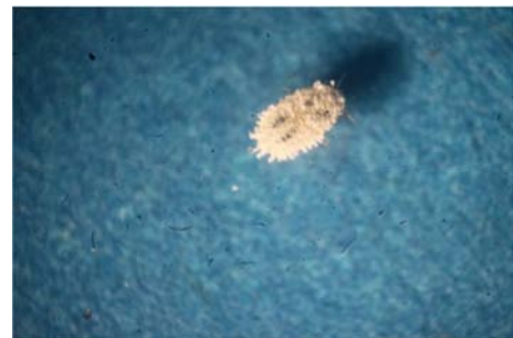
Figure 11. Second instar (3.5 X).

The second moulting occurred within 6-9 days after first moulting with an average of 7.50 \pm 0.268 days (Table 3). They secreted dense cottony fibres which over their bodies. According to Kabir [13], the duration of second moulting was 6-8 days. The present findings are in close conformity with the report of Kabir [13].