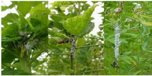
Figure 7. Mealy bug infested kenaf and Mesta plants at Tarabo, Narayanganj, BJRI.