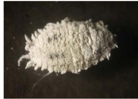
Figure 13. Adult (3.5 X).