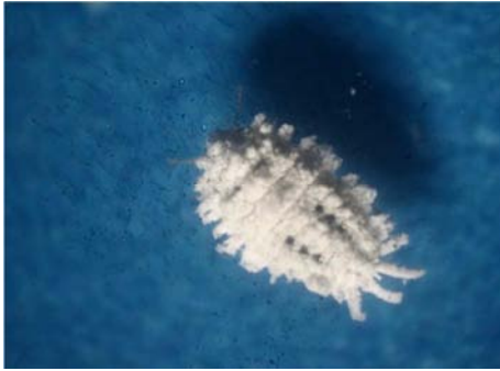
Figure 12. Third instar (3.5 X).