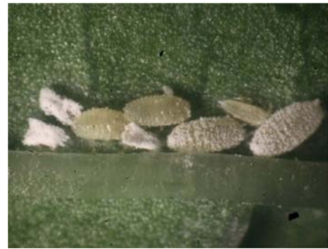
Figure 10. First molting of neonate crawler (3.5 X).

The first moulting occurred within 4-5 days with an average of 4.6 \pm 0.163 days (Table 3). The body color changed from light yellow to brown. After some hours they secreted white powder and waxy powder which gradually became dense. According to Kabir [13] the duration of the first instar was 5-10 days.