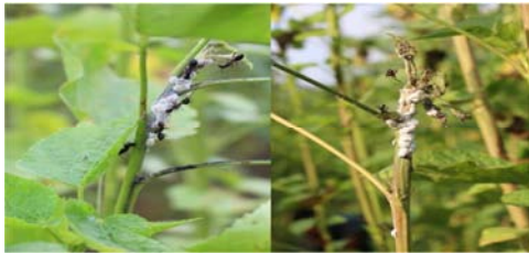
Figure 8. Mealy bug infested Mesta plants at Patuakhali sub-Station.