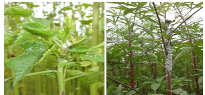
Figure 5. Mealy bug infested kenaf plant at Chandina regional Station.