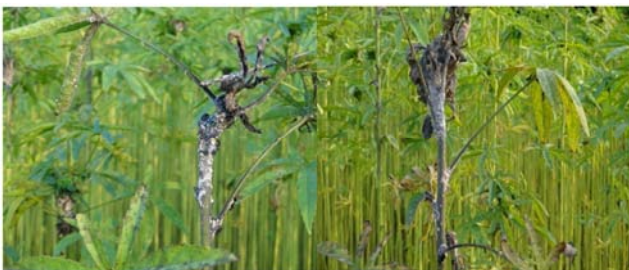
Figure 2. Mealy bug infested field of jute at Faridpur regional station, BJRI.