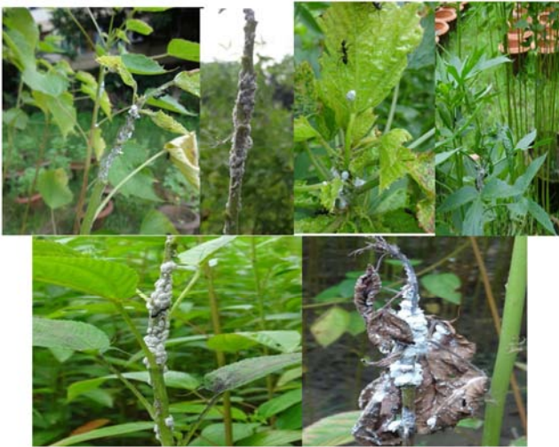
Figure 1. Mealy bug infested field of kenaf at Central station, Dhaka, BJRI.

Some pictorial view of mealybug infested fields in locationwise are given below: