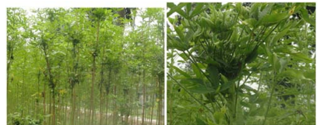
Figure 4. Mealy bug infested kenaf plant at Rangpur regional Station.