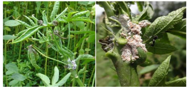
Figure 3. Mealy bug infested plant at Madhupur, Tangail region.